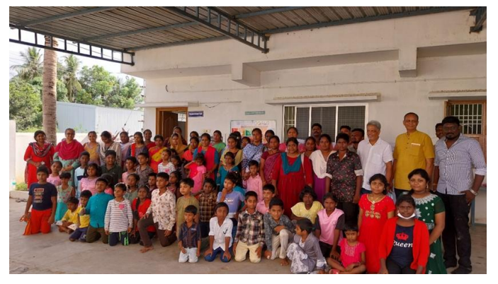
Tiruvallur Summer Camp